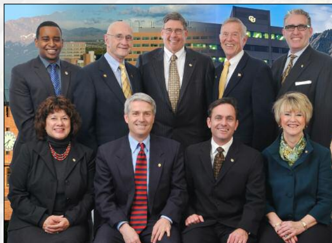
2012 University of Colorado Board of Regents